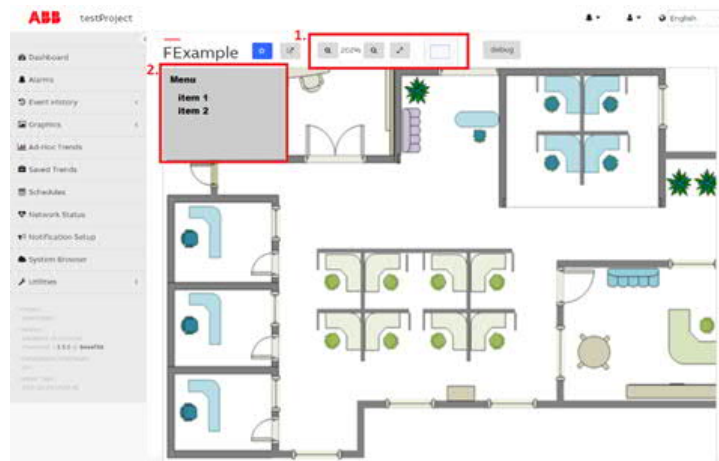
ABB Releases ASPECT 3.06 with Scalable Graphics