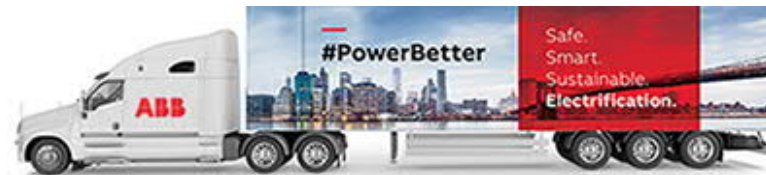
ABB is bringing the latest electrical products, services, and solutions directly to you. Our #PowerBetter tour is a trade show on wheels, showcasing the complete best of both integrated ABB one-line from source to socket portfolio. The #PowerBetter

Keep up with us on the road, March 14-June 10, 2022 #PowerBetter Roadshow