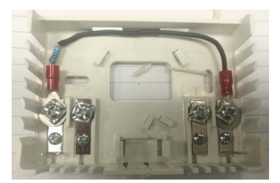
Figure 2: KIT-1RK installed at SBC-STAT

In cases where the controller is difficult to access, or the SBC-STAT is locally available, the 1k ohm resistor may be installed across the bus terminals as depicted in Figure 2. Because the terminals of the SBC-STAT are far apart, and the resistor will require a wire lead modification to reach the terminals. American Auto-Matrix has assembled an extension lead resistor for easy installation (KIT-1RK). When fitting the assembly to the Stat, it should be positioned as in the photo to keep the resistor body away from the PCB sensor board as much as possible.