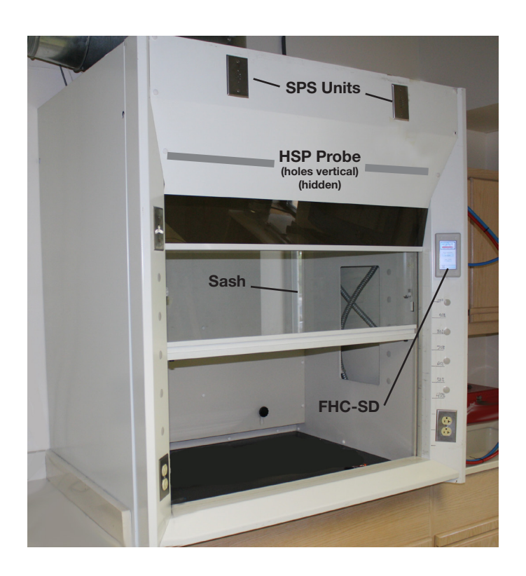
Typical Fume Hood Installation